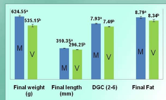
Figure 1. Weight, length, DGC and FAT after 9 months.

Results are means. Significant differences between tanks were determined by one-way ANOVA. Values over the bars pairs having different superscript letters are significantly different (P<0.05). DGC is the daily growth rate between period 1 and 7 = (W_7^{1/3} - W_7^{1/3})t_{1 \rightarrow 7} .