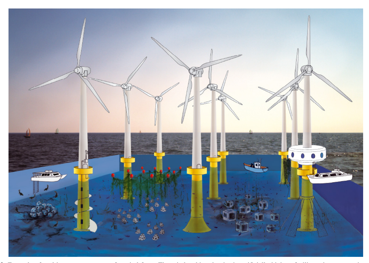
Fig. 2. Example of multi-use management of a wind farm. The wind turbine density is artificially high to facilitate the presentation of the concept. From left to right: diving, scientific studies, aquaculture, fishing, tourism. © Denis Lacroix, Ifremer and Malo Lacroix.

of all the ways and means to maximize the usefulness of it for all stakeholders (Pioch et al. in press). The evolution in the design and management of marine construction could contribute to a reduction in their negative impact. Actually, it has been estimated that habitat destruction remains the first cause of biodiversity loss for 67% of endangered marine species (Bœuf 2008).