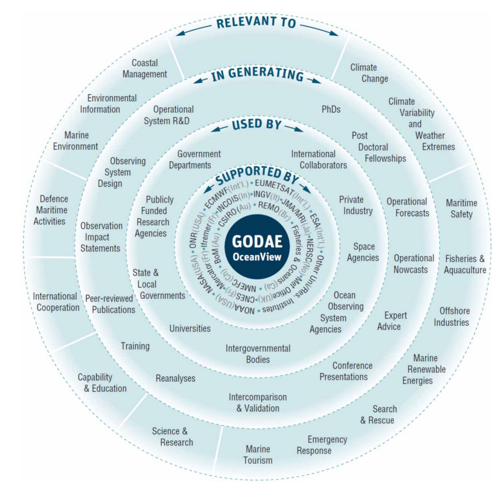
Figure 1. 'Circle diagram' (read from inside to out) illustrating how GOV links with the entire maritime sector, to generate scientific outputs that deliver benefits across all relevant sectors of global economy, society and environment. Abbreviations in parenthesis behend supporting institutions: Int'l = international, It = Italy, JA = Japan, No = Norway, Fr = France, In = India, Br = Brazil, Ca = Canada, Ch = China, Au= Australia.

biases in the forecasts of temperatures and improve the predictions of near-surface currents. Not surprisingly, this is an active area of research using field studies and large eddy simulations to develop improved parameterizations (McWilliams and Danabasoglu 2002; Molemaker et al. 2010). Coupled atmosphere-wave-ocean models will allow more complete representation of these processes, provided the models have sufficient spatial and temporal resolution to resolve them. Improved parameterization of other sub-grid scale processes such as the breaking of internal gravity waves could also be important (Liang and Thurnherr 2012). Improved treatment of the grid-scale closure in high-resolution models (e.g. the two-dimensional dissipation of enstrophy cascading to smaller grid-scales and the transfer of energy towards larger scales) may also be important; the original formulation of the Gent-McWilliams (Gent et al. 1995) scheme seems a less satisfactory solution to this issue in eddy-resolving models than coarse resolution ones.