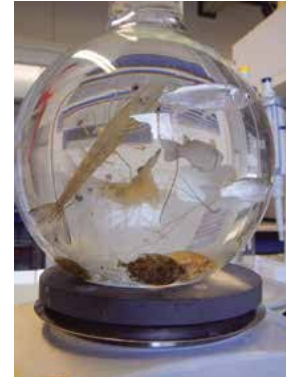
Mullet and rabbitfish are potential species for polyculture with blue shrimp.

leted feed at 3 to 5% of shrimp biomass daily. At the beginning and end of 12 weeks of culture, shrimp and fish were sampled and individually weighted to evaluate the growth performance. Environmental parameters were regularly sampled and analyzed to estimate environmental variations.