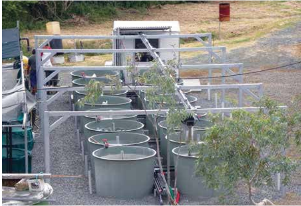
The outdoor culture system was set up at Saint Vincent station in Boulouparis, New Caledonia, to help find suitable fish for polyculture with shrimp that could contribute to sustaining the area's shrimp industry.