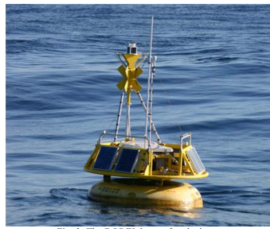
Fig. 3: The BOREL buoy after deployment

rate. In case of a material failure, we can remotely switch from a link to the other one and reestablish the data transmission channel. A preventive reset is done daily on the UGB to prevent from any software issue blocking data transmission.