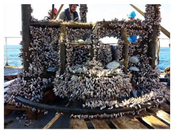
Fig. 4: cirripods on BOREL's keel after recovery in 2015

complete check of the electronics, batteries and external wiring is performed. Due to its critical role with regard to the whole observatory, a new mooring line is installed every year.