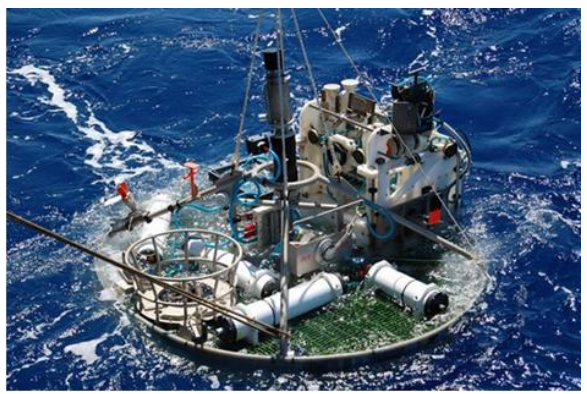
Fig.2. The SEAMON EAST node during deployment

SEAMON East is installed 600 m away from SEAMON West, at the base of the active Tour Eiffel edifice. It is dedicated to studying the links between faunal dynamics and physico-chemical factors. The node is composed with several elements such as an Ifremer SMOOVE (SMart Ocean Observatory Video Equipment) high definition video camera fitted with a solid-state drive and four pressure-balanced-oil-filled LED lights, an Aanderaa® optode, a Wetlabs® turbidimeter, an Ifremer Chemini in situ iron analyser and since 2013 and an Ifremer CISICS (Cabled in situ Instrumented Colonizer System).