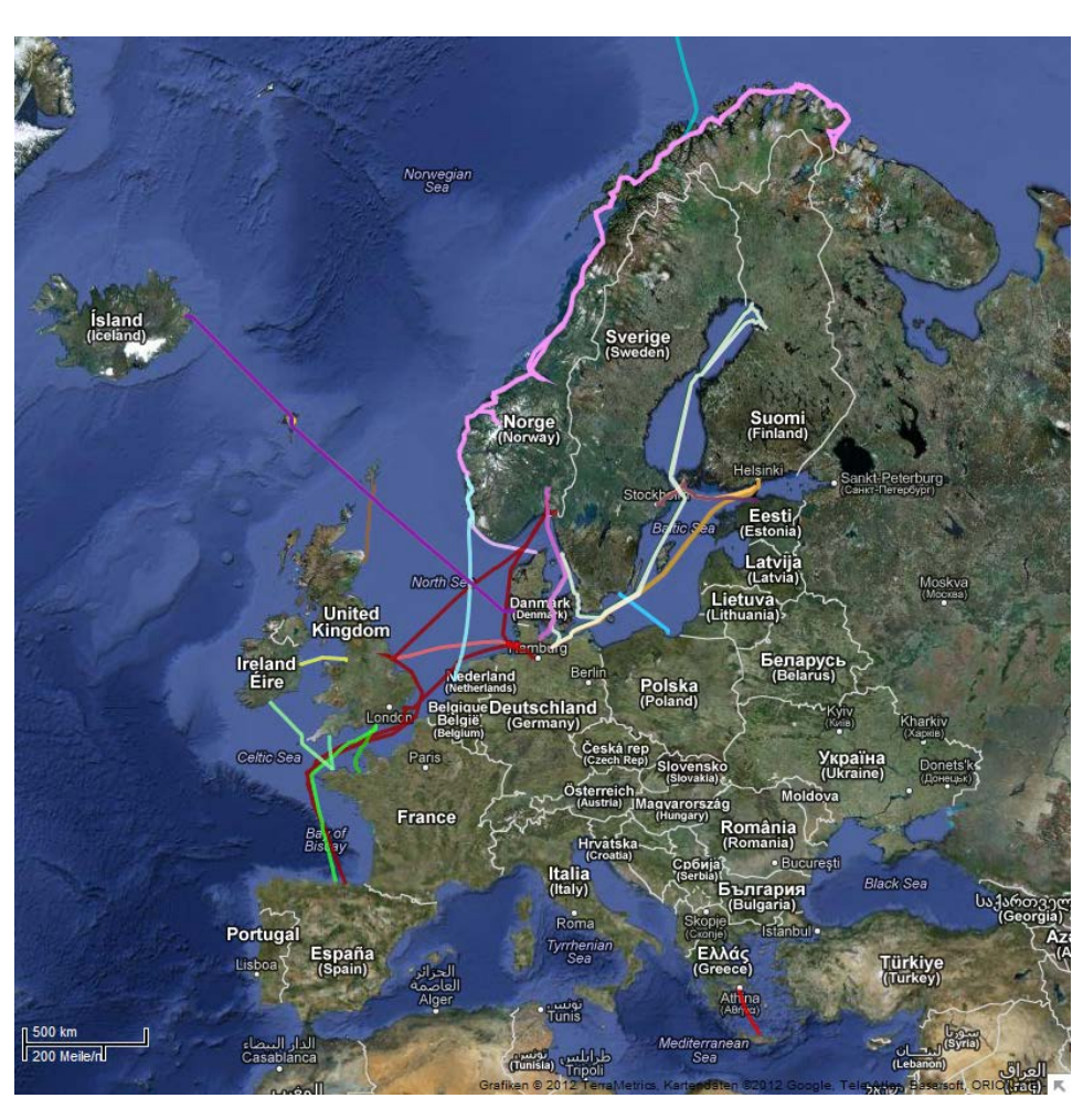
Figure 1.1. Map is showing Ferrybox routes currently operating in European waters (<u>www.ferrybox.org</u>).

The core FerryBox parameters are Sea Surface Temperature (SST), Salinity, Turbidity and Chlorophyll-a-Fluorescence. For example, in addition 6 systems measure dissolved oxygen, 6 - nutrients (nutrients are measured from most other systems following collection of water samples), 3 - pH, 3 - pCO2, 2 - Phycocyanin.