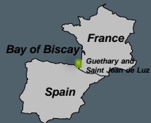
Fig. 1. Location of the two sampling stations.

Two independent Indicator Species Analyses (ISA) were carried out on two taxa matrix (mobile and fixed fauna) using the R package "indicspecies". It provides a set of functions to assess the strength and statistical significance of the relationship between species occurrence/abundance and groups of sites (microhabitats).