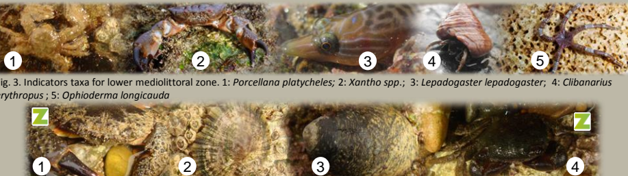
Fig. 3. Indicators taxa for lower mediollittoral zone. 1: Porcellana platycheles ; 2: Xantho spp.; 3: Lepadogaster lepadogaster ; 4: Clibanarius erythropus ; 5: Ophioderma longicauda