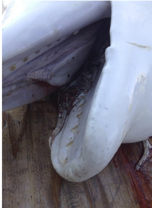
Fig. 2. Photograph taken by a Ulukhaktomuit harvester (G. Okheena) of a beluga whale with prey in its mouth. Prey is identified as Sandlance ( Ammodytes sp.).

In this study, both mature (>10 GLG) (Robeck et al. 2005) and subadult neonate whales had full or partially full stomachs. Some harvester sampling data sheets were returned with incomplete or insufficient comments regarding beluga stomach contents. For example, if no comments were made under the “stomach contents” section, we interpreted this as the stomach either had not been checked or was not sampled. In one particular case, a female whale (ULU 14 19) was observed to have an empty stomach but a full mouth of food (Fig. 2). Of the whales sampled, seven stomachs contained partially digested fish and hard parts, the remainder contained only hard parts [(i.e., invertebrate structures, otoliths (Table 1)]. Sandlance otoliths had a 92% FO whereby >82.7% of all otoliths aged were between ages 1+ and 3+, while the maximum observed age was 6+. Nonbiota such as sand and pebbles were the second most FO at 75%. These observations support beluga feeding on Sandlance, and species known to burrow in substrate (Pearson et al. 1984). Sandlance larvae became the second most abundant fish larvae in the Beaufort Sea in 2011 following its first observation in 2010 (Falardeau et al. 2014). Among Arctic cod otoliths ( n = 18 ), 63% were between ages 0+ and 2+, with a maximum age of 4+. Two eelpouts ( Lycodes sp.) were examined to be ages 2+ and 5+, and one flounder ( Pleuronectidae sp.) was identified as age 7+ (Table 1).