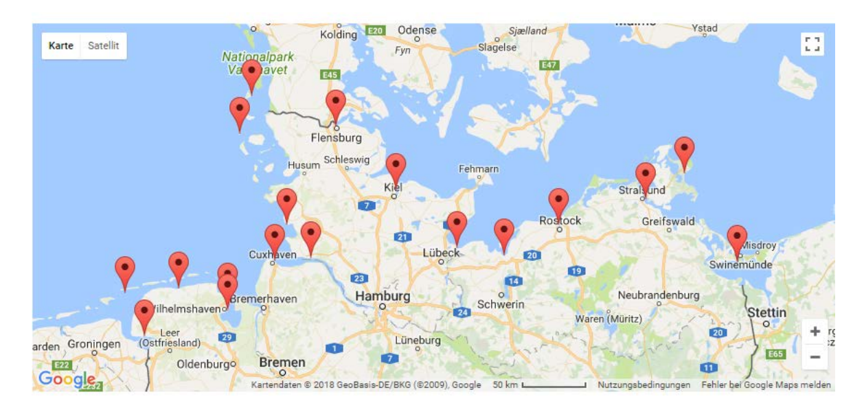
Figure 1. German stations for MSFD NIS monitoring and assessment.

The second species is a small, round shaped, dark colonial ascidian tunicate found in Büsum (North Sea). The taxonomic analysis is currently on going.