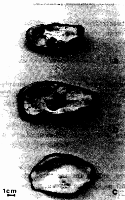
Fig. 3. Anomalies in the calcifications of the upper valve in the Japanese oyster. a = sample IV in tank with 50 cm 2 panel coated with antifouling paint, b = sample I in Port de Boyardville, c = sample III reference tank.