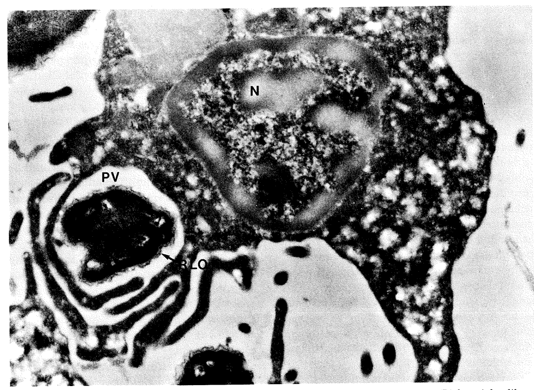
Fig. 3. Pecten maximus . Transmission electron micrograph of scallop hemocytes infected with RLO (Rickettsiales-like organism) cells and fixed 30 min after parasite challenge, showing progressive engulfment of RLO into a phagocytic vacuole (PV); N: hemocyte nucleus. (× 16 000)