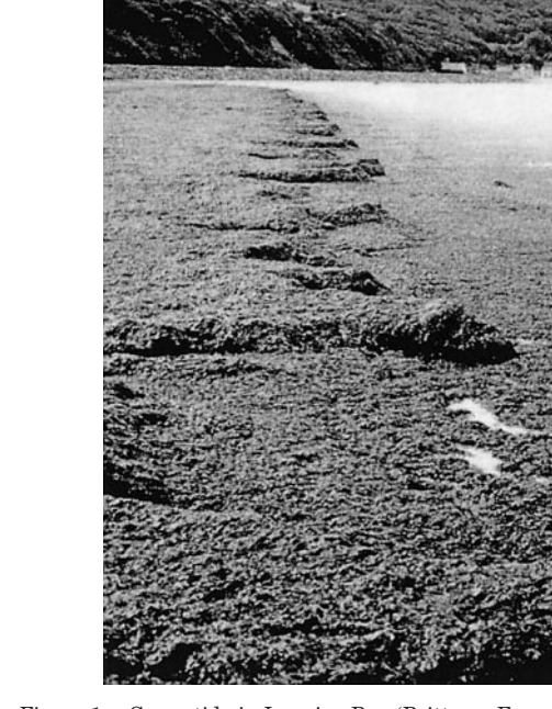
Figure 1. Green tide in Lannion Bay (Brittany, France).

in the Venice Lagoon (600,000 t fresh weight), in Brittany (50,000–70,000 t), or in Peel Inlet (100,000–600,000 t). The annual production may be estimated to be 1.5 to 4.5 times higher than the maximum biomass present at the site, in respect of an algal density high or low, as in the Venice Lagoon (SFRISO et al. , 1993). CASABIANCA-CHASSANY (1992) indicates a ratio of 2.6 in the Prévost Lagoon (France), based upon measurements of particulate nitrogen, and NIENHUIS (1992) reports a ratio of 3 for the Veerse Meer lagoon (Netherlands).