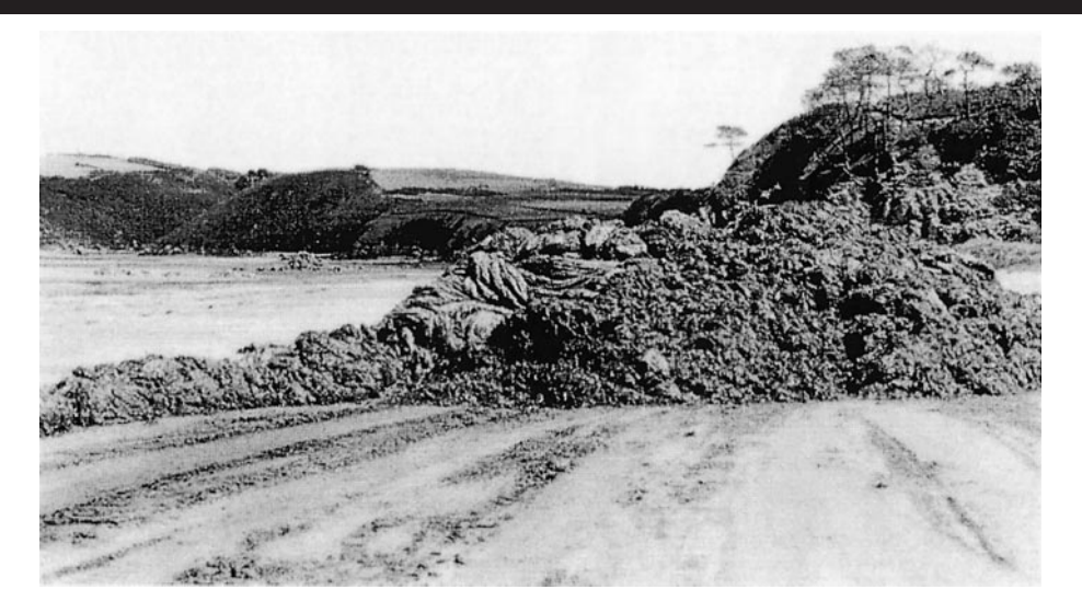
Figure 2. Ulva collect in Hillion Bay (Brittany, France). Harvesting is made with loaders, resulting in the collection of a heterogeneous mixture of seaweed and sand.

often considered to be positive. In some cases, seaweed proliferations provide a supplementary food source which can have a favourable effect on the development of herbivores. Another significant ecological role of excessive growths of algae is the provision of habitats and refuges against predators. For instance, LENANTON et al. (1985) noted that an increase in fish catches followed an increase in the biomass of Cla dophora and Chaetomorpha , while VIRNSTEIN and CARBO-NARA (1985) reported high densities of small animals (peracarid crustaceans, gastropod molluscs, etc. ) in Gracilaria drift beds. These proliferations do, however, pose significant fouling problems in aquacultural areas.