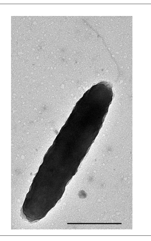
Fig. 1. Electron micrograph of a negatively stained cell of strain 13IX/A01/164^{T} harvested during the exponential phase. A single polar flagellum is shown. Bar, 1 \mu m.

The strain was grown in marine broth medium (MB 2216; Difco). Marine broth medium with a range of salinities was prepared according to the composition provided by the manufacturer with the appropriate NaCl concentration. To study growth at a range of pH values, MES, PIPES, AMPSO or MOPS (Sigma) was added to marine broth medium to reach the required pH. Cultures were incubated at 30 °C under aerobic conditions. Methods for the determination of growth parameters were as reported by Wery et al. (2001b). Growth was observed at 10-40 °C, with optimum growth at 30 °C (see Supplementary Fig. S1a available in IJSEM Online). The strain grew at NaCl concentrations of 0-70 g l<sup>-1</sup>; an optimum concentration for growth could be defined at 10 g l<sup>-1</sup>, but growth rates were quite similar at 5 and 20–40 g l^{-1} (Supplementary Fig. S1b). Growth occurred at pH 5.0-10.0, with a clear optimum at pH 8.0. A linear increase