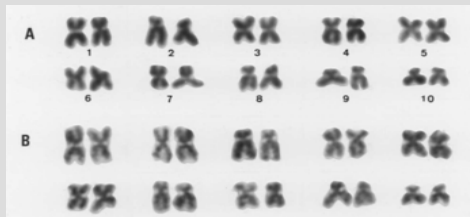
Figure 3 : Giemsa-stained karyotype of C. gasar samples from Senegal (A) and French Guyana (B).

The karyotypes of the French Guyana and Senegal sample were very similar (Figure 3), corresponding to C. gasar with 6 metacentric (m) and 4 submetacentric (sm) chromosome pairs. These were clearly different from the C. rhizophorae karyotype previously described in Mexico Samples (see Leitaó et al. , 1999, Malacologia , 41(1), 175-186).