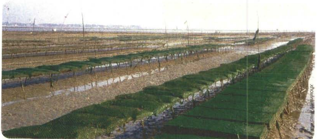
The South Brittany site where oysters were reared

Large scale mortalities of C. gigas have been reported in all areas of the world where this species is cultivated. Examination of the question of oyster summer mortality in France has suggested that there are complex interactions between the oyster, their environment and opportunistic pathogens. For the oyster, a large genetic basis was shown to exist for observed variation in resistance to summer mortality. This has opened up possibilities of improvement by selection and has in turn allowed us to select oysters that are 'resistant' (R) or 'susceptible' (S) to summer mortalities (Dégremont et al., 2007). As we have demonstrated that the physiological state of the animal plays a major part in this interaction (Huvel et al., 2004; Samain et al., 2007), the selected genetic character is likely to be connected with one or more functions within the oyster that explain the differential survival observed between R and S. >>>