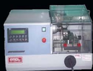
High speed diamond saw