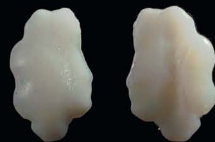
Concave et convex sides of the otolith

Roundnose grenadier grows slowly and its long-term longevity is estimated at 60 years.