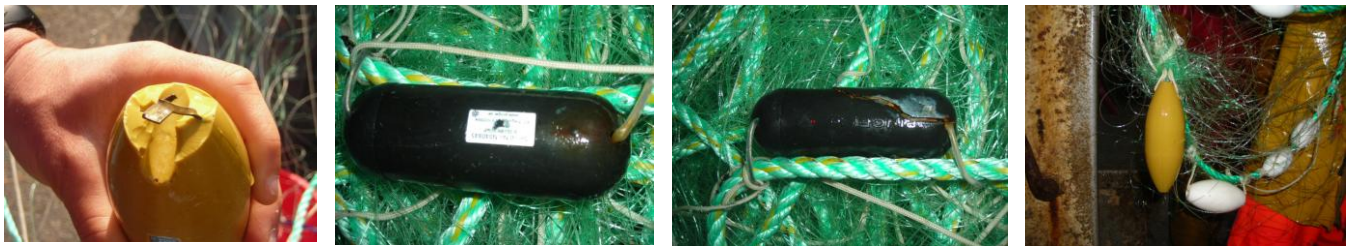
Figure 2: Some damaged pingers indicating an actual lack of certification of the pinger models; pinger inducing fouling of the nets

(1) at the rate of one immersion per month; (2) at the rate of two immersions per month; (3) at the rate of two immersions per month and spacing imposed by the EC regulation