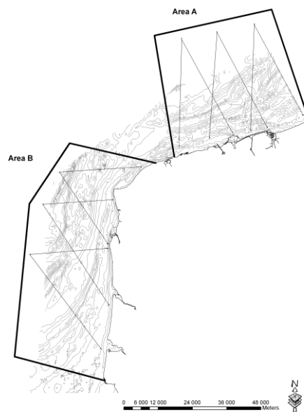
Figure 5: Ship based survey from the Belgian border to the Bay of Somme in 2009

In 2009, OCEAMM, a non-governmental organization (Zyuzcoote, France), conducted in the framework of the study FilManCet, ship based standard line-transect surveys from the Belgian border to the Bay of Somme (in side areas VIIId and IVc). 12 saw-tooth pattern line transects were surveyed. The study area was divided in two subdivisions (Figure 5) and the surveys were carried during two seasons: March-April and August-September. A total of 282.4 km on effort was covered for the first period and 421.8 km for the second period (total of 704.2 km).