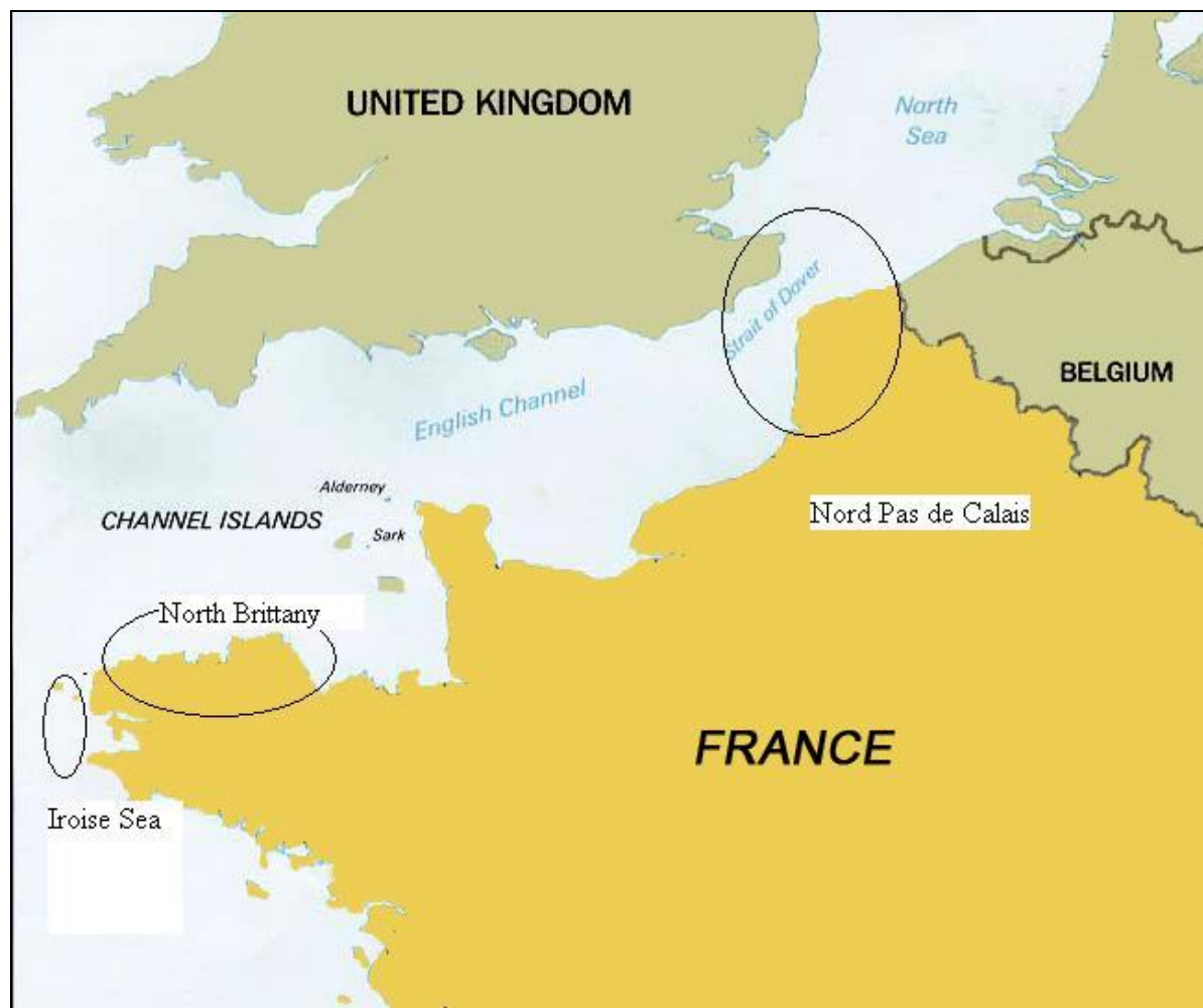
Figure 1: French areas of the bycatch study in the English Channel

Two studies (Pingingroise and FilManCet) were conducted in that area. Filmancet study comprises two different areas: North Brittany and Nord Pas de Calais (Figure 1). The main objectives are to quantify accidental catches of marine mammals in set nets and identify solutions to limit them. Pingingroise is a study dedicated to the set net fishery in the Iroise area at the west of Brittany. The three objectives of that study in a marine protected area was to make comparative trials with pingers, to determine the bycatch in set net fishery operating inside and around the Marine protected area and to estimate the abundance and the distribution of cetaceans.