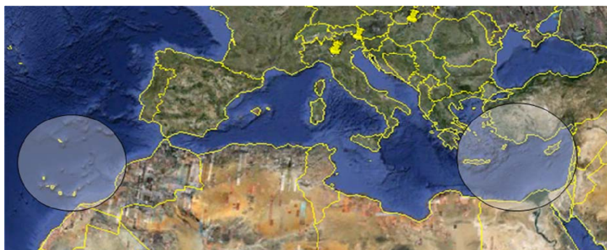
Figure 2: The circles indicate the areas where Gambierdiscus sp. was recently found in Europe.

In January 2004 a fisherman's family showed symptoms of CFP after eating part of a 26 kg Amberjack ( Seriola Rivoliana ) captured during scuba diving along the coasts of Canary Islands. A 150 g sample of the fish that was kept frozen at fisherman's home was analysed by a sodium channel-specific in vitro assay and LC-MS/MS. The assay results were positive and the CTX content of the fish sample was estimated to be 1.0 µg/kg. The presence of C-CTX-1 in the fish was confirmed by LC-MS/MS (Pérez-Arellano et al., 2005).