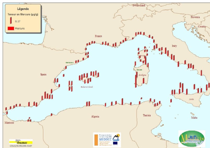
Figure 1. Mercury in mussels ( \sum PCBi \text{ ng.g}^{-1} dry weight)

Several sites were found to be impacted by mercury (Fig. 1): first and foremost the Portoscuso site in Sardinia (South Western sub-basin), with a maximum level of 0.31 mg/kg, witnessing significant contamination generated by a large industrial complex. To a slightly lesser degree, high levels are recorded in the South Western sub-basin in Skida (0.19 mg /kg), in the Tyrrhenian sub-basin especially in Palermo (0.22 mg /kg) and in the Ionian sub-basin in Augusta (0.20 mg/kg). For this metal we cannot observe differences between the Eastern basin and the Western basin for background levels.