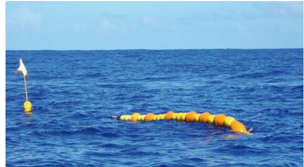
Maldives (top) and Indian Ocean (bottom) artisanal FADs. On the Maldives FAD, aggregators are attached to the array of small buoys floating on surface, not to the main mooring line

in designing long-lasting FADs. Using aggregators as separate components (e.g. double-headed FAD, Indian Ocean style, Maldives style) may be preferable to placing aggregators on the mooring line.