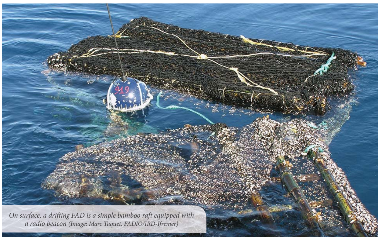
On surface, a drifting FAD is a simple bamboo raft equipped with a radio beacon

While expansion of fishing grounds can help to distribute exploitation over a broader area, it is theorized that previously unexploited areas may represent natural reserves or “stock sinks” that help to replenish heavily exploited areas. Drifting objects tend to aggregate particular species or life stages that can contribute to differential exploitation with negative ecological impact.