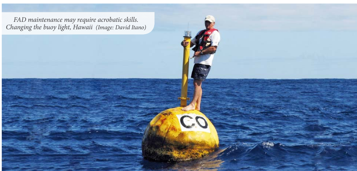
FAD maintenance may require acrobatic skills. Changing the buoy light, Hawaii