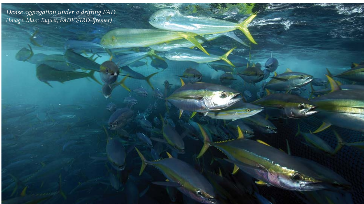
Dense aggregation under a drifting FAD

It was recognized that the use of dFADs has greatly increased the economic viability and potential yield from tuna fisheries worldwide, and that it is not reasonable to abandon this highly efficient tool. Drifting FADs and their electronic marking buoys should be considered as individual units of fishing gear that must be managed to preserve the viability of pelagic ecosystems and sustainable tuna fisheries.