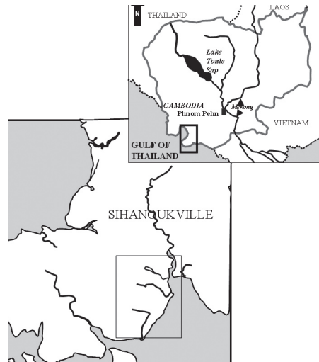
Fig. 1. Map of Cambodia showing the location of the rehabilitated polders at Sihanoukville.

The rehabilitation of these polders in 1998 aimed to recover about 10,000 -