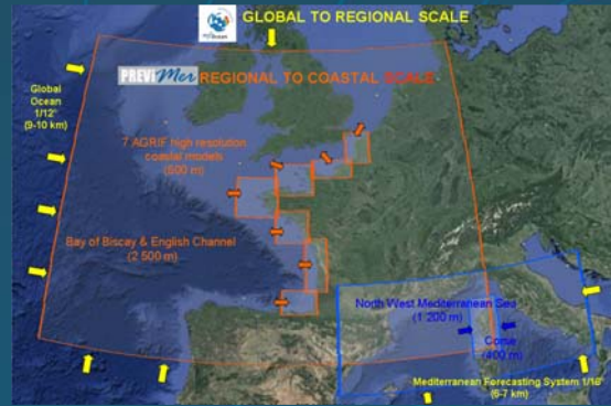
Downscaling from global (MyOcean) to regional and coastal scale (PREVIMER)