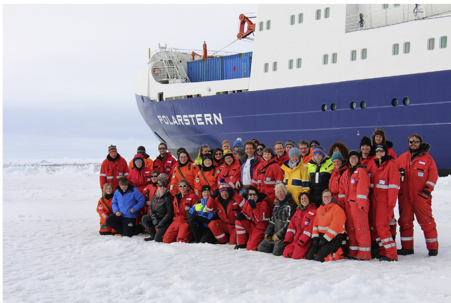
Fig. 3. Participants of the TRANSIZ expedition in front of the German research icebreaker RV Polarstern.

resources in terms of money, time, and human resources in order to participate in such exchange and communication efforts play a crucial role, not least among Arctic indigenous peoples. Often ECS are only very rarely represented in meetings where recommendations to stakeholders and decision-makers are discussed.