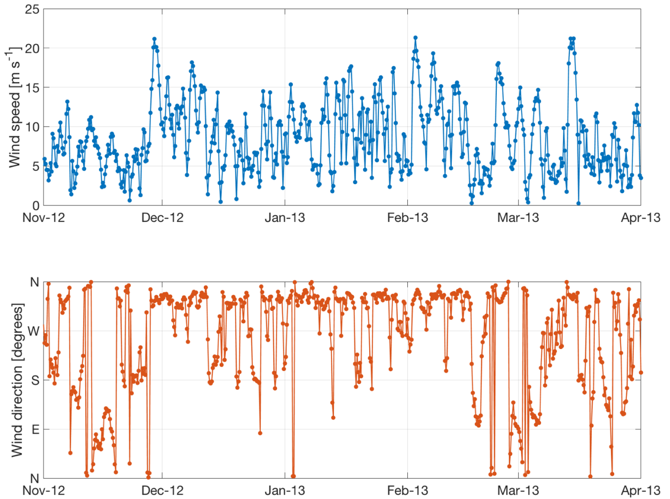
Figure S1. Wind speed and direction time series at 10 m from November 2012 to April 2013. 6-hourly wind data are extracted from ECMWF (European Centre for Medium-Range Weather Forecasts) re-analysis at the LION buoy location (42.1°N-4.7°E). Wind direction is reported in cardinal directions (measured in degrees clockwise from due north).