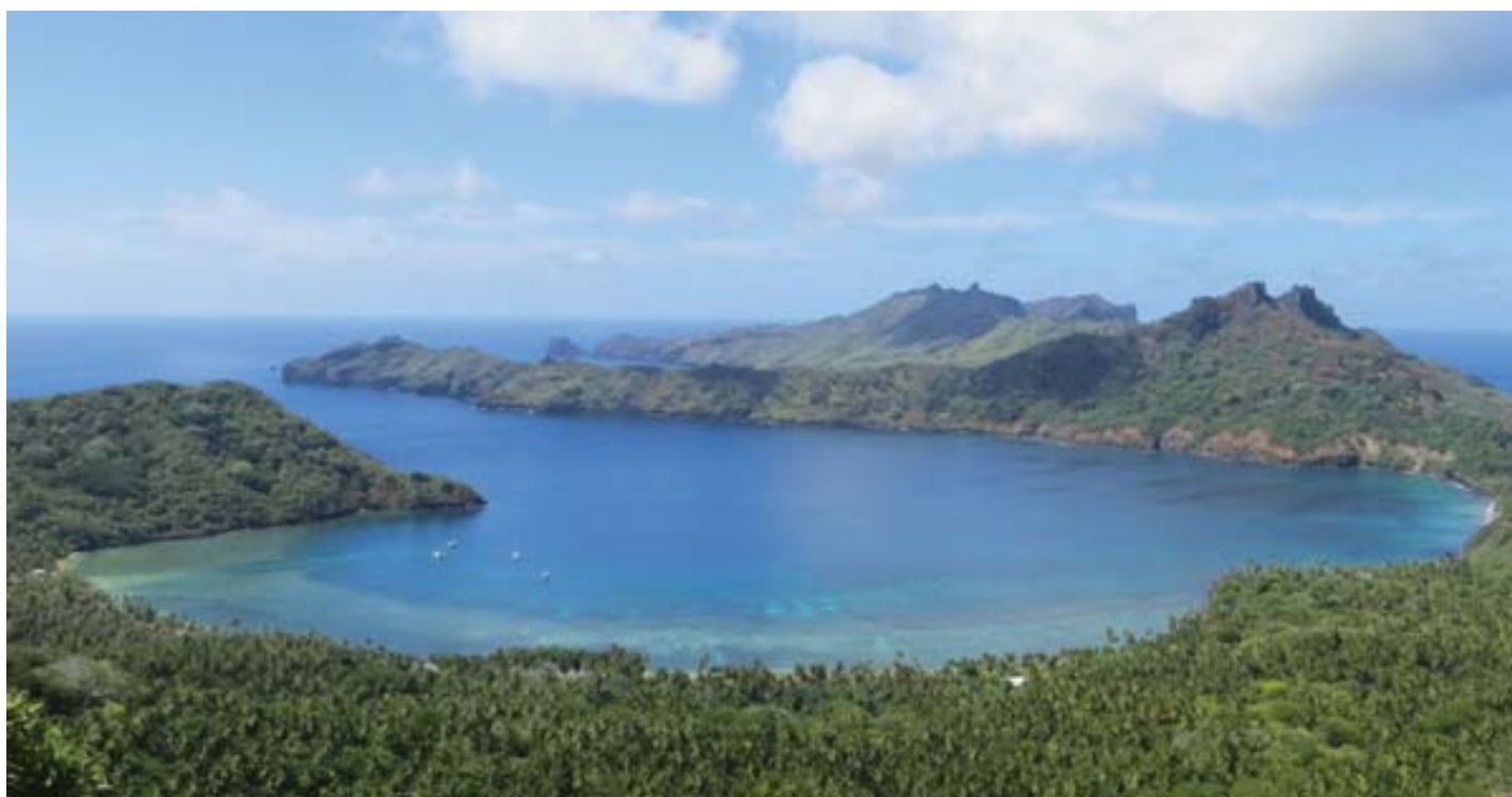
Fig. 1. Study site of Anaho Bay in Nuku Hiva Island, Marquesas Archipelago, French Polynesia

Unfortunately, in both cases, no food remnants were available for confirmation analysis. Instead, field investigations were undertaken periodically in the toxic area in order to survey the toxicity level in these 2 groups of marine invertebrates and assess the identity