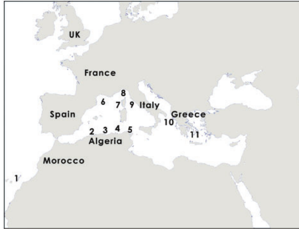
Figure 1. Map of sampling locations of bogues (1: Tenerife Island, 2: Gulf of Oran, 3: Gulf of Bejaia, 4: Gulf of Annaba, 5: Gulf of Tunis, 6: Gulf of Lions, 7: Corsica Island, 8: Ligurian Sea, 9: Tyrrhenian Sea, 10: Ionian Sea, 11: Aegean Sea).

Sea (MEDITS surveys), on board fishing vessels and from fish markets. The sex of the sampled individuals was determined by macroscopic examination of their gonads and only mature fish were included in this study to minimize the effect of sexual maturity, which may affect otolith shape (Cardinale et al. , 2004). Moreover, to limit the effect of age on the otolith shape, the age range of fish sampled was limited from 2 to 4 years. To estimate the age of each individual, whole sagittal otoliths were examined, after cleaning, by two expert age readers to limit interpretation errors. To increase the visibility of the growth marks, otoliths were covered with clove essential oil and observed with a stereomicroscope under reflected light on a dark background.