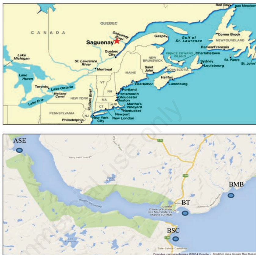
Figure 1. Map of the study area showing the 4 sites where bivalves were sampled. BT, Baie de Tadoussac; BSC, Baie Sainte-Catherine; BMB, Baie du Moulin-à-Baude; ASE, Anse Saint-Étienne.

some xenobiotics can change with salinity and affect their bioavailability enable them to be absorbed by the sediments particles and accumulate in the organisms. 23 Because of this chemical variation, all comparisons with ASE, need to be done with a lot of cautiousness