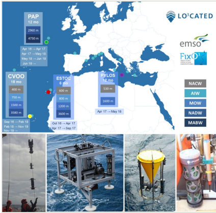
Figure 2. doi

a range on in situ elements under the auspices of the Global Ocean Observing System (GOOS; IOC 2019, Weller et al. 2019) and more specifically to their regional (e.g, EOOS) and deep ocean (DOOS) counterparts.