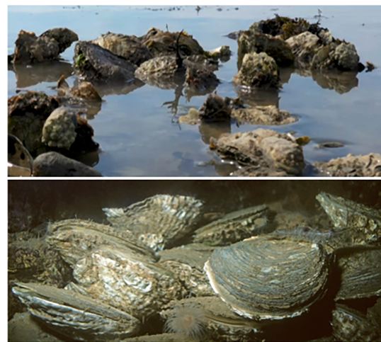
FIGURE 1 The native European oyster, Ostrea edulis . As an ecosystem engineer and an ecological keystone species, it provides a range of ecosystem functions and services

Active knowledge transfer has been established within the growing NORA community, which connects institutions, experts, and practitioners from research, nature conservation, and commercial production, as well as ecological consultants, policy advisors, and local stakeholders (see www.noraeurope.eu ). There are annual meetings to present results, to discuss and exchange experiences between active restoration projects and oyster producers, and to increase cooperation between them. The community is represented via the advisory board and will collaborate on defined topics in specific working groups. In addition, the NORA Secretariat maintains communications, organizes conferences, and coordinates the activities of the working groups.