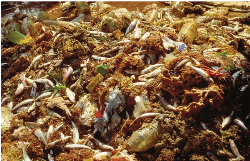
Fig. 2.1 Litter collected by trawling in the Mediterranean Sea, France. 10 min experiment