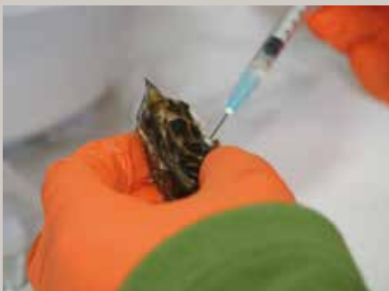
Collection of hemolymph from a young cupped oyster