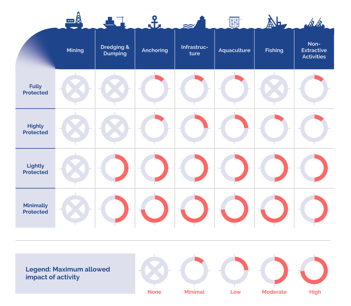
Fig. 1. Level of protection based on maximum allowed impact of seven

duration, and frequency relative to biodiversity conservation goals and is described as "none," "low," "moderate," "high/large," or "incompatible with biodiversity conservation" (Fig. 1 and fig. S2). Using this impact scale, a LEVEL of protection can be assigned for any given MPA or zone regardless of location, species, or circumstances. Impacts of certain activities may scale differently considering specific features of an MPA or zone, such as size: for example, distribution of an activity across areas of different sizes may render it high impact in a smaller MPA but moderate impact in a larger MPA. Incompatible activities include industrial extraction such as industrial fishing (for example, vessels > 12 m using towed or dragged gears), oil and gas exploration, mining, or other extremely impactful activities such as fishing with dynamite or poison (supplementary materials, LEVELS Expanded Guidance,