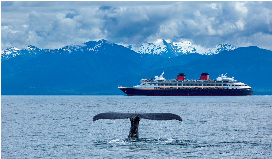
Fig. 1. The aviation industry offers useful lessons for the shipping industry on how to manage wildlife collisions, which point to crucial steps for better protecting whales.

There are some key theoretical similarities with the aviation industry (Fig. 2). Both whale–ship and bird–aircraft