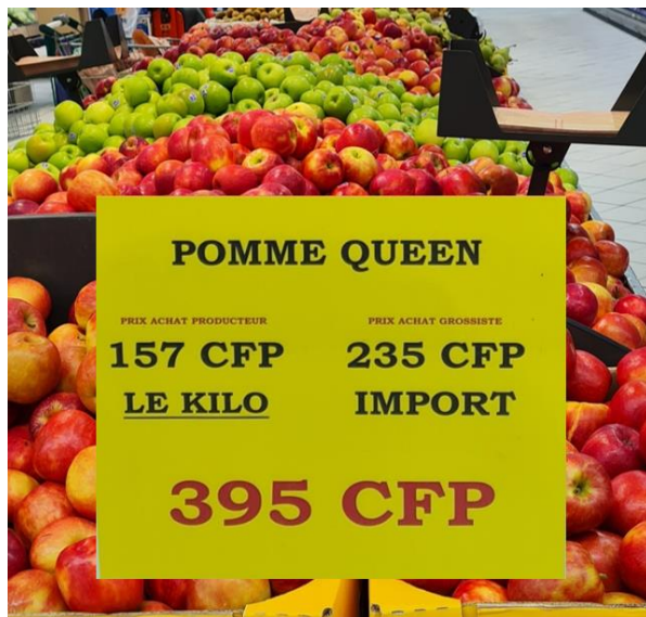
Figure 3. Example of market transparency where the price of the product (apples) is displayed along with the prices paid to the producer and intermediate distributor. Picture from a grocery store in New Caledonia where this transparency measure, along with several market regulation decrees, has been implemented by the agricultural sector since 2014.

publishers that actually provide additional contributions to the work performed by authors, such as improved content, complementary media design, or outreach support (Odlyzko 1997, Bachrach et al. 1998). Various journals already embrace open and author-led reviewing processes as ways to save the present demise of the scientific reviewing system (Aarssen and Lortie 1998, Peerage of Science), with several of them also publishing reviewer names and/or comments alongside research articles (Warne 2015, Eisen 2019, F1000Research, Ideas in Ecology and Evolution). This practice could further be expanded to publishing reviewers' bio- and bibliographies with articles as ways to increase recognition of expert contributions (Riley and Jones 2016). Another way to promote contributions could be for publishers using sustainable practices to state transparently their business model (e.g. % fees affiliated to the publication process versus profit margins, Grossmann and Brembs 2019) when inviting researchers to participate in reviewing or editing tasks (Figure 3). Besides, alleviating publication fees can help make larger portions of funding available for research per se , which will constitute non-negligible support to the overall academic community. Recently, many journals with increasingly lower publication fees have emerged. In fact, scientific journals