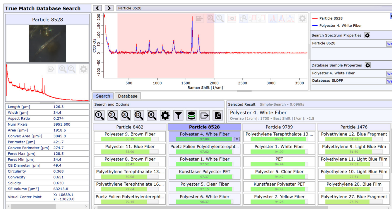
Fig. 2. Example of a microplastic particle identified by Raman spectroscopy using a combination of several spectral databases (Cabernard et al. 2018; Munno et al. 2020; von der Esch et al. 2020a). Left side: Particle image, raw Raman spectra, and particle details derived by image analysis. Right side: Processed spectra (red) and assigned library spectrum (blue) for the selected particle and reference spectra (highlighted in violet) combined with material name and further information.