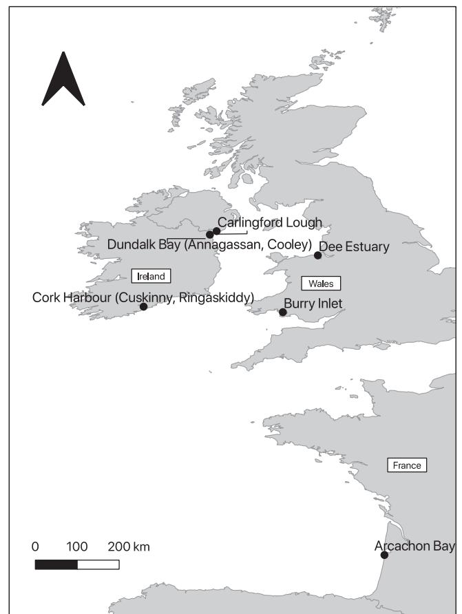
Fig. 1. Locations (and sites within) studied in a 19-month survey of growth rates in Cerastoderma edule . At each location, one site was examined with the exceptions of two sites at Dundalk and Cork Harbour.

Every other month from April 2018 until October 2019, approximately 30 cockles were collected. Cockles ( n = 2133 ) were gathered from six locations (three Irish ( n = 1174 ), two Welsh ( n = 720 ), and one French ( n = 239 ; Fig. 1). Two Irish locations (Dundalk Bay and Cork Harbour) were sampled at two distinct sites (Fig. 1). At every site (six in total), cockles were opportunistically collected from the intertidal areas with rakes and by hand, at low tide. At Carlingford and Cork, cockles