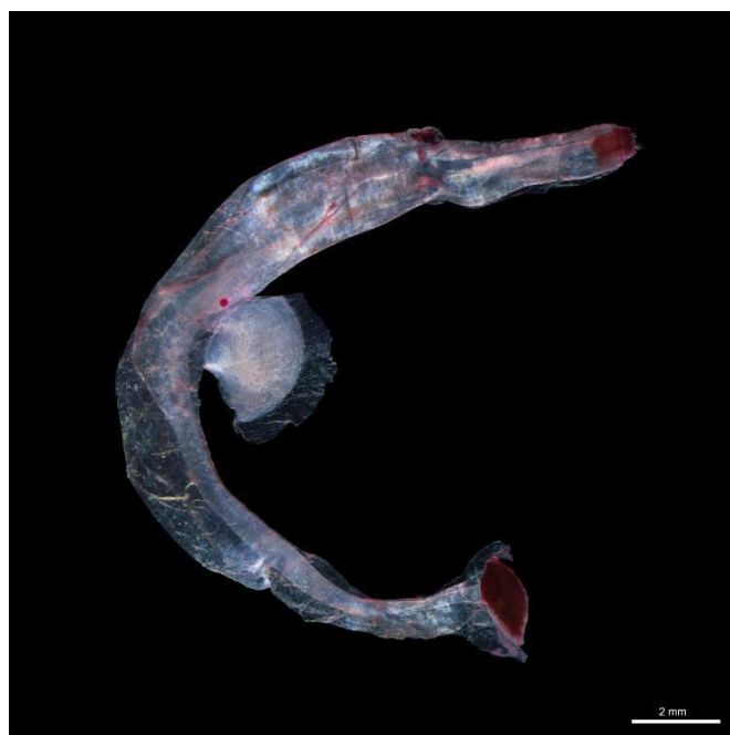
Figure 2. Firoloida desmarestia Lesuer (1817) sampled off Fernando de Noronha Archipelago, Brazil.