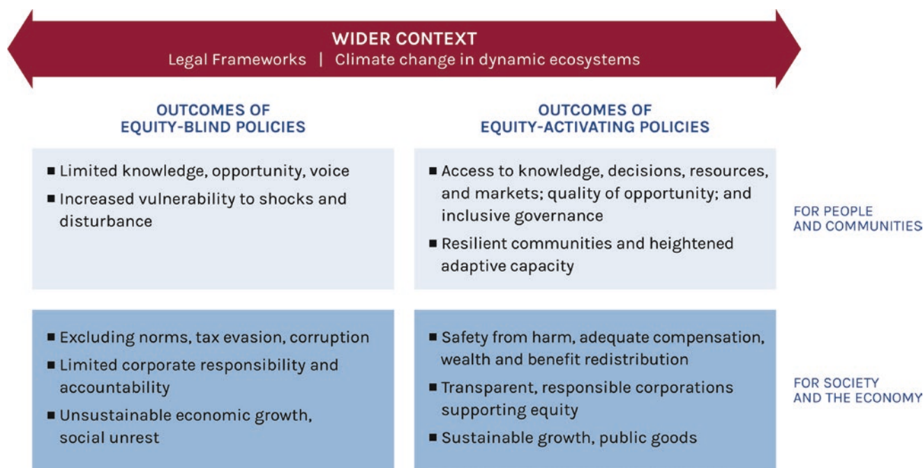
Fig. 13.3 Differences between equity-blind and equity-activating policies and practice

change projections indicate increasing impacts on already vulnerable nations and urgently demand that justice be considered in all sectors, at all political levels, and that policies to increase equity be urgently implemented.