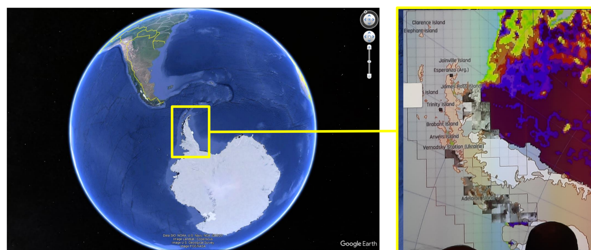
Antarctic sampling zone