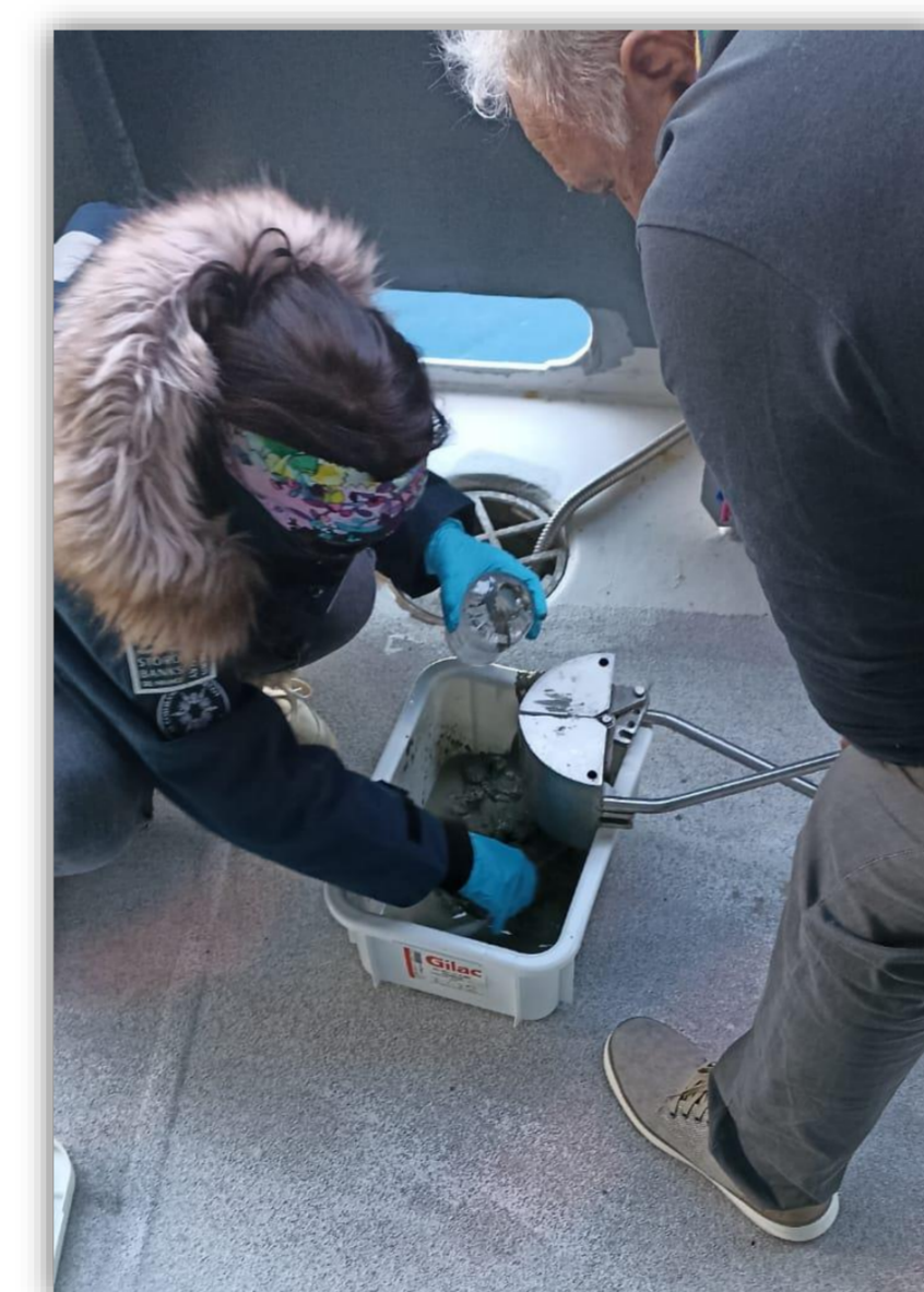
Van Veen core

Sampling for microplastics and trace metals analysis in sediments have been carried out using several technics (grabs operated from light boat, telescopic poles, sampling spatulas...) depending sampling site characteristics (conformation, bathymetry...)