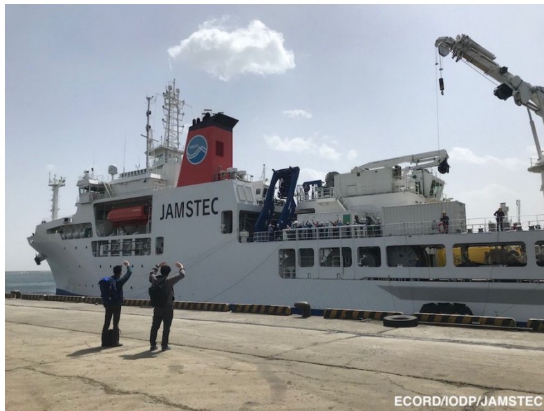
The research vessel R/V Kaimei.