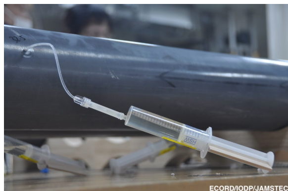
Retrieving the interstitial samples from the cores onboard.