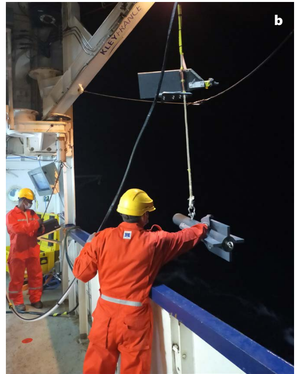
FIGURE 2. (a) The standard CTD rosette employed in the framework of the GEOTRACES GS02 SWINGS cruise comes back aboard. (b) The “fish” is launched off the side of R/V Marion-Dufresne as part of the GEOTRACES GS02 SWINGS cruise.

rosette or in situ pumps) in order to study bottom processes (Homoky et al., 2013). A clean sampling “fish” can also be deployed behind the ship while sailing, providing samples for BTM distribution at the surface along the section tracks (Cutter and Bruland, 2012; Figure 2b ). Phytoplankton sampling nets can also be deployed, because they give access to the first step of the trophic chain, with phytoplankton community composition and dynamics influenced by the abundance of different BTM. If ice or snow sampling is required, appropriate tools must be on board. All sensors allowing the measurement of meteorological conditions must be deployed. Once the samples are on board, each team goes to work in its own small laboratory.