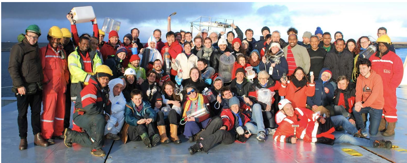
FIGURE 3. Scientists and crew on the French GEOTRACES SWINGS cruise (GS02) on R/V Marion-Dufresne .

using the current state of technology. From the most efficient to the least, they included: using new technologies for propulsion (mostly biofuels, but also sails, kites, etc.), reducing the volume of transit by prepositioning the ships in the different oceanic basins and by reducing transit velocity, using various drones/floats for complementary operations, and improving hydrodynamics and materials during ship construction. All these proposals are still debated within the community and also more broadly; only a concerted international effort will ensure the success of this ambitious objective.