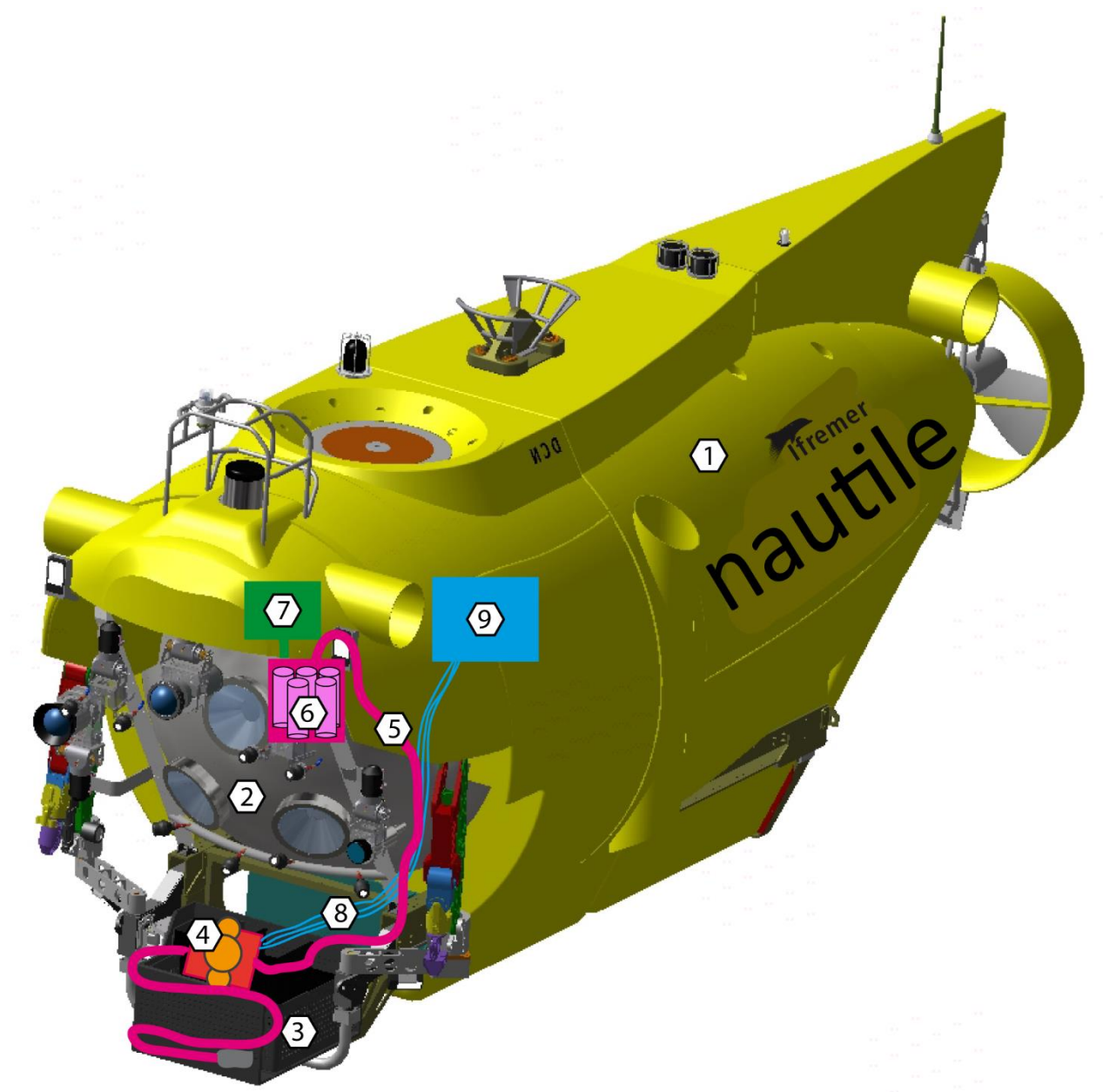
Figure S2 supplementary data: schematic representation of the FISH system implementation on the submersible and the various connections made. 1: Submersible, 2: Front of submersible, 3: Basket of submersible, 4: FISH system, 5: suction hose, 6: bowls of suction sampler, 7: pump of suction sampler, 8: hydraulic hoses, 9: hydraulic power supply of submersible. Nautille drawing courtesy of V Ciausiu (DFO/SM).