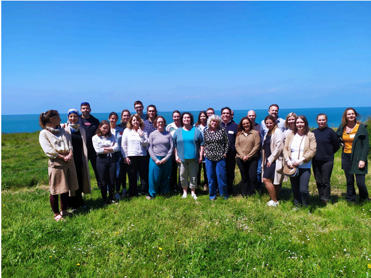
Figure 2: TT-CYTO workshop attendees group photo.