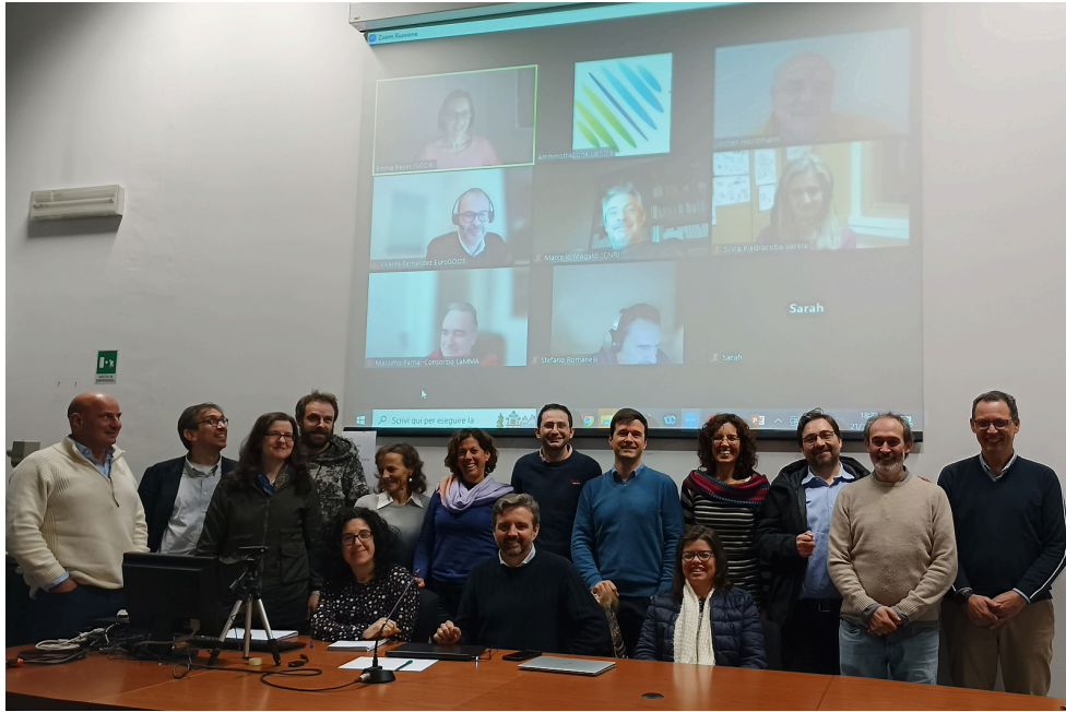
Figure 1 - HFR workshop attendees group photo.

This specialised workshop was open to both project partners and external participants and focused on the topics described as follow: