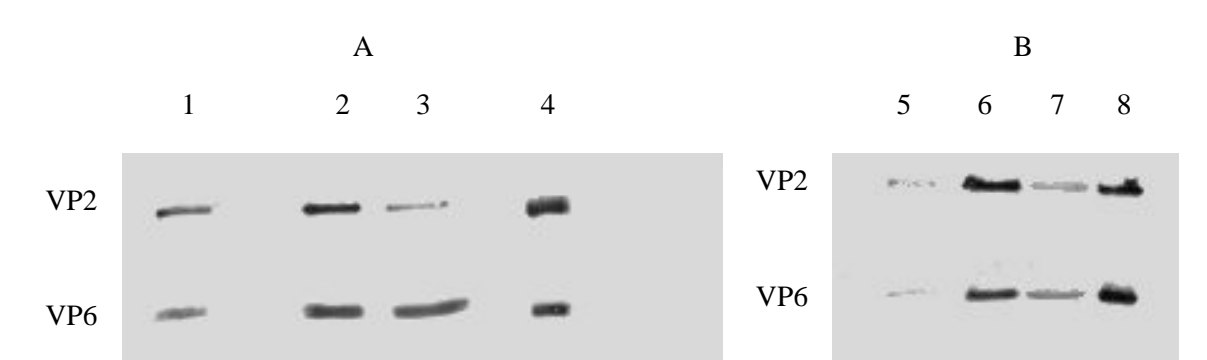
Figure 2 : Analysis of infectious rotavirus and VLP2/6 proteins by western-blot. A: proteins VP2 and VP6 present in rotavirus particles at day 2 (2) and day 4 (1). Positive controls: 10<sup>6</sup> particles/ml (3) and 10<sup>8</sup> particles/ml (4). B: proteins VP2 and VP6 present in VLP2/6 particles at day 2 (6) and day 4 (5). Positive controls: 10<sup>6</sup> particles/ml (7) and 10<sup>7</sup> particles/ml (8).

After concentration of seawater samples, the two types of particles were analyzed by SDS-PAGE and Western blot to confirm the presence of each protein VP2 and VP6. Both proteins were detected on the membrane through day 4, with the intensity of the bands decreasing each day. The relative concentrations of rotavirus and VLP2/6 were estimated based on the intensity of the band compared to those of known quantities of positive controls. A concentration of about 10<sup>8</sup> particles/ml was found at day 0 and 1 for bovine rotavirus and VLP. Figure 2 shows results for virus particles and VLP2/6 obtained after day 2 and 4 in seawater. The estimated concentrations of virus particles and VLP2/6 were about 10<sup>7</sup> particles/ml at day 2. At day 4, the virus concentration was about 10<sup>6</sup> particles/ml, and for VLP2/6, the concentration was estimated between 10<sup>6</sup> and 10<sup>5</sup> particles /ml (weak signal detected on the membrane, Fig.2B). At day 6, concentrations were below the limit of detection using this method. These data are similar to and confirm the results obtained using ELISA.